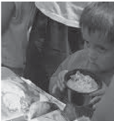
Hunger knows no friend but it's feeder.

table everyday? There are millions of people world wide who starve for days, weeks, months. There are many poor countries around the world and it is a terrible aspect of our humanity. According to thinkquest.com, every year 15 million children die of hunger and 3 billion people in the world today struggle to survive on US $2 a day. Well, you know how your parents tell you to eat all your food because there are people that have nothing to eat? Unbelievably, it's true. Of all the countries in the world these top 10 are the poorest Zimbabwe, Congo, Burundi, Liberia, Guinea-Bissau, Somalia, Central African Republic, Eritrea, Niger, and Sierra Leone says