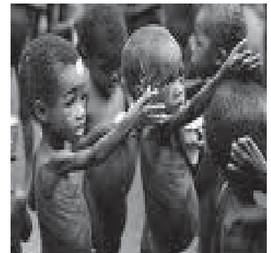
If you can't feed a hundred people, then just feed one.

There are people all over who help and volunteer to make a difference in the world. If you think you can't make a difference, you're wrong. To prevent